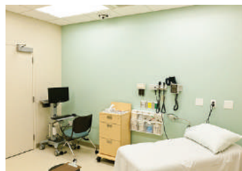
Medical surgeries or dental