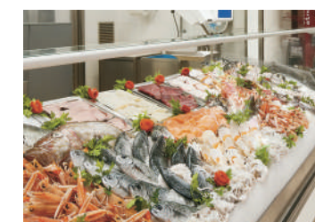
Fish storage warehouses