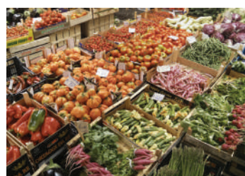
Fruit conservation warehouses and vegetables